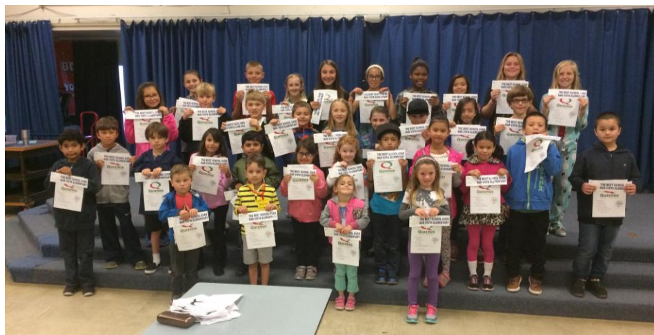
October students of the month – Sponsored by Quiznos