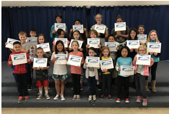
May Students of the Month