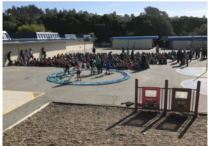
21 Days of Kindness Rally