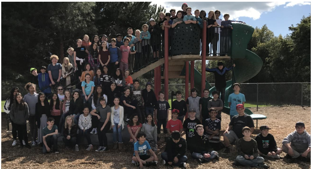
Class of 2017