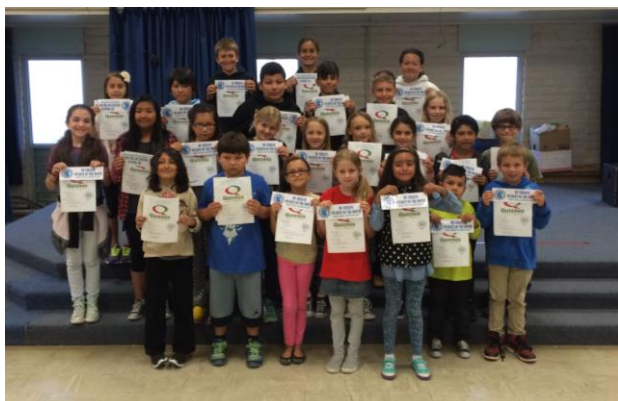
May Students of the Month

Back to School Night (Intermediate) 5:45-7:00