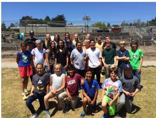
Mar Vista International Team Representing Ireland