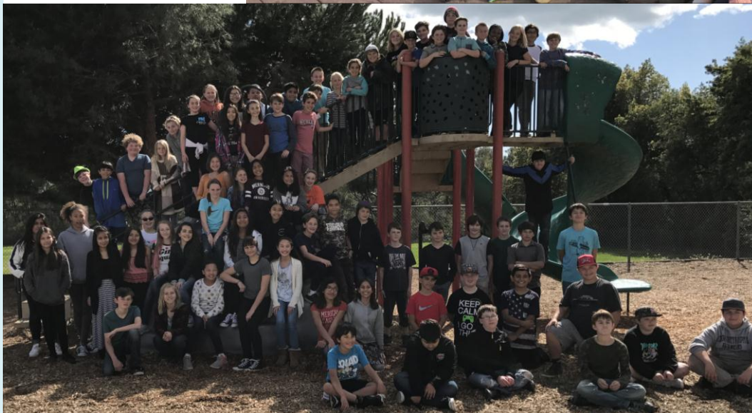
Class of 2017