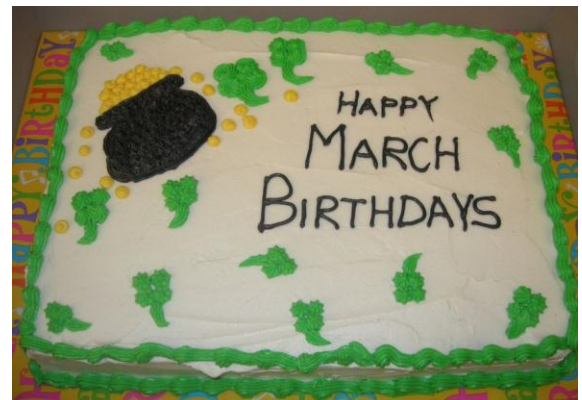
March 2017 Birthdays