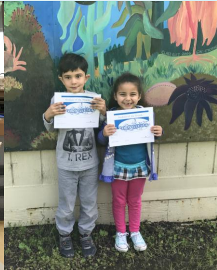
February Student of the Month