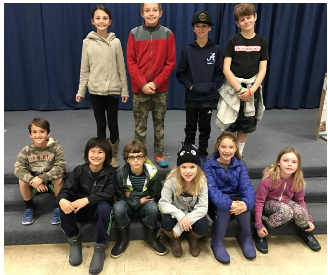
Science Fair Finalists