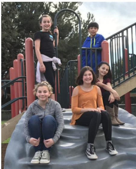
Student Council Officers