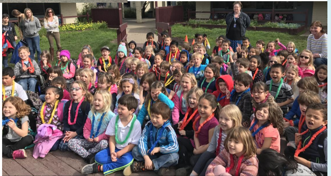
Some of our newest Valencia Kindergarten students