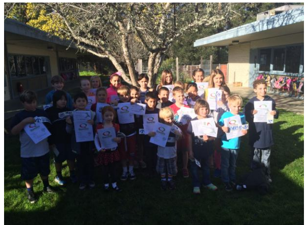
March Students of the Month