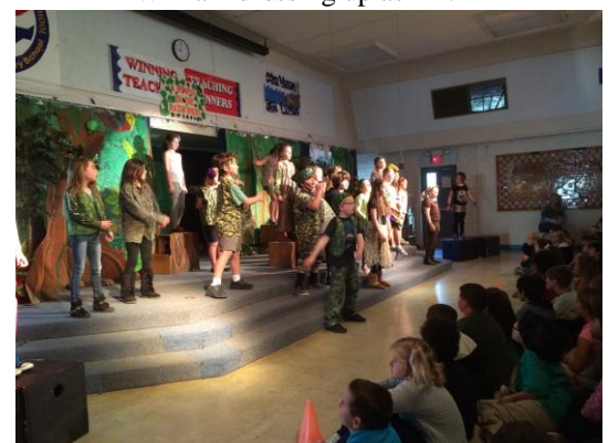
Rumpus in the Rainforest