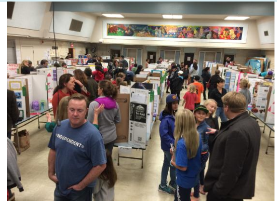
Annual Science Faire

These events do not include the many field trips classes went on during the month. What a wonderful place to go to school!!