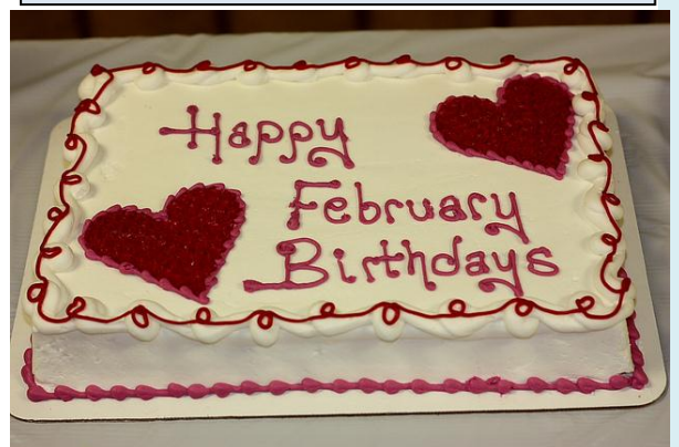
February 2016 Birthdays