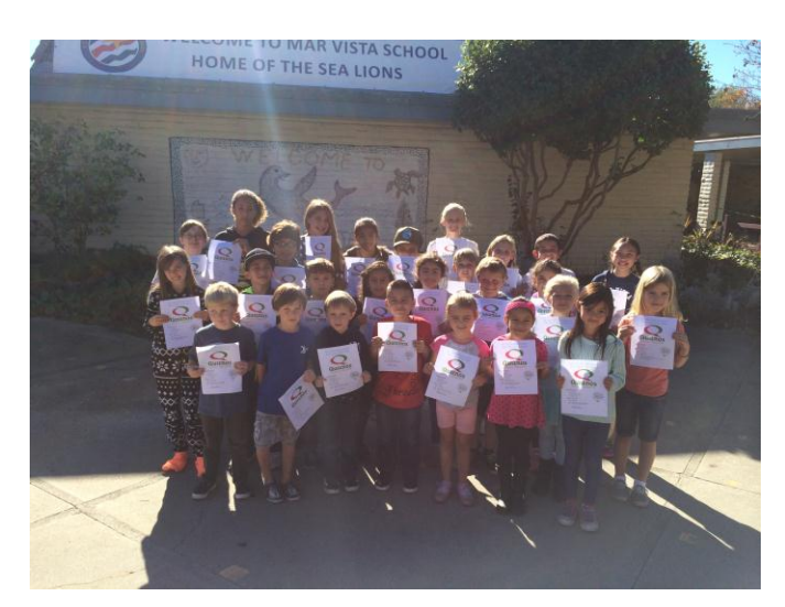
November students of the month – Sponsored by Quiznos