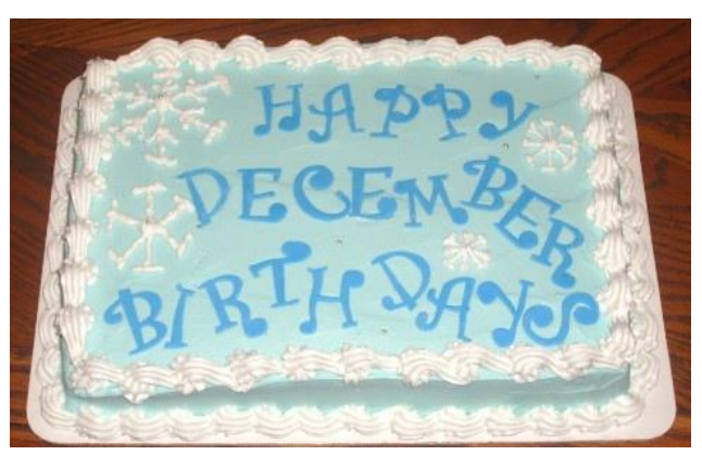
December 2015 Birthdays