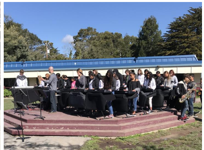
Shoreline Middle School performs for Mar Vista