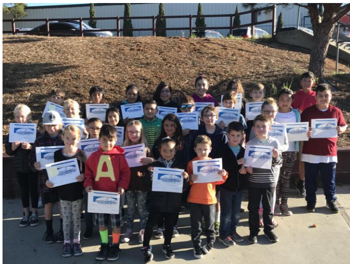
March Students of the Month