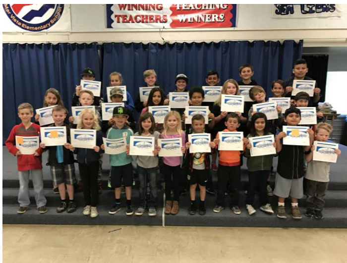
April Students of the Month