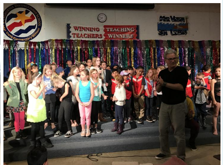
Mar Vista Annual Talent Show